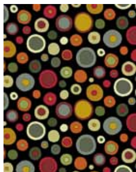
5285-K ¾ yard