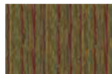
5289-C ¾ yard (extra yardage needed for backing)