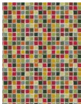
5286-R ¾ yard