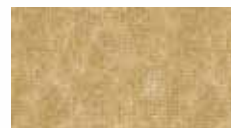
3135-Y 1 ¼ yards