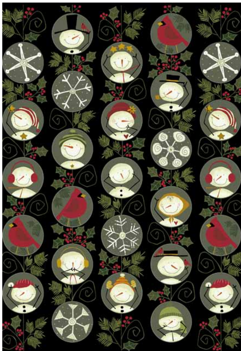
5290-K 1 ¼ yards

Fabrics shown are 15% of actual size. All fabrics are used in quilt pattern.