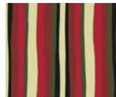
5309-R ¾ yard