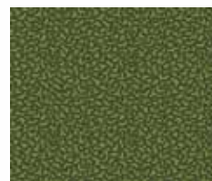
5288-G ⅝ yard