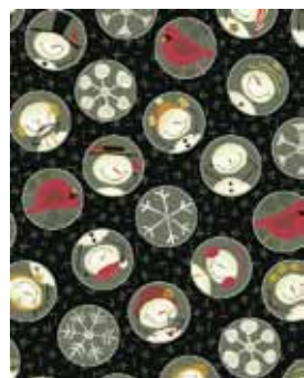
5334-K 1 ¾ yards